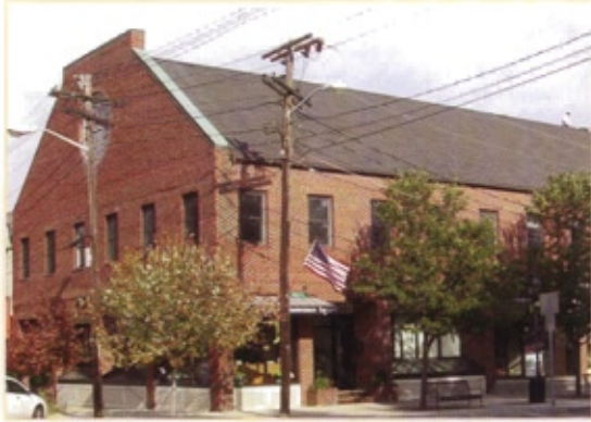
55 MARKET STREET IN IPSWICH

With a broad mix of tenants, Symes' building at 55 Market Street in Ipswich, provides the community of downtown Ipswich with various services. The 12,000 SF building's largest tenant is the Ipswich Church of the Nazarene.