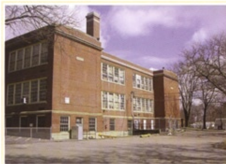
REAR VIEW OF MONTROSE SCHOOL

Wakefield's Board of Selectmen recently decided to sell the old Montrose School in Wakefield. The building has not operated as a school in more than six years and is currently used as a storage site. Symes participated in the RFP process and was selected to purchase the land and develop it.